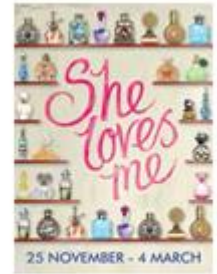
SHE LOVES ME Menier Chocolate Factory