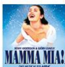
MAMMA MIA! Novella Theatre