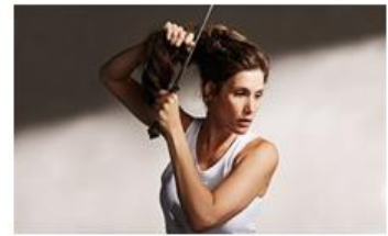
SAINT JOAN The Donmar Warehouse