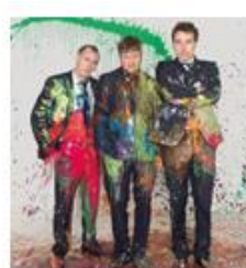
ART The Old Vic