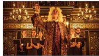
ALL THE ANGELS Sam Wanamaker Playhouse