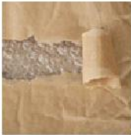
WISHLIST Royal Court