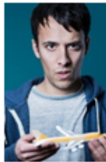
BU21 Trafalgar Studios