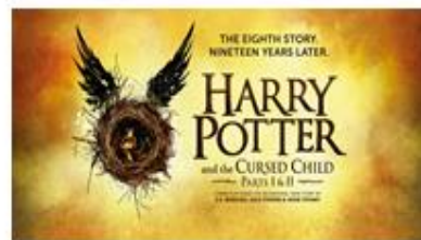
HARRY POTTER AND THE CURSED CHILD Palace Theatre