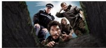
RAISING MARTHA Park Theatre