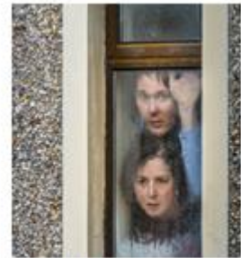
AUTUMN ROYAL The Everyman Theatre Cork