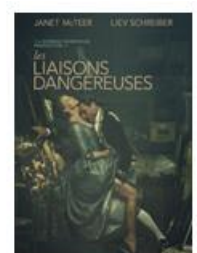
LES LIAISONS DANGEREUSES The Booth Theatre, New York