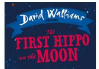
THE FIRST HIPPO ON THE MOON UK tour