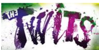
THE TWITS UK TOUR