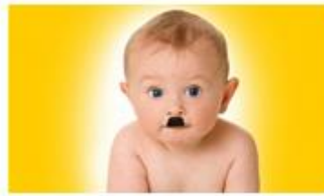
WHAT'S IN A NAME? Birmingham Repertory Theatre