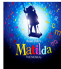
MATILDA Cambridge Theatre