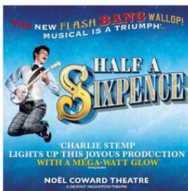
HALF A SIXPENCE: Noel Coward Theatre